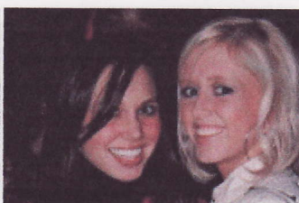
1/21/07 PUSSYCAT LOUNGE