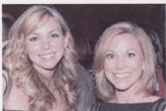
1/20/07 DIAMOND IN THE ROUGH