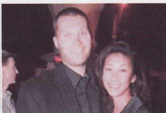
1/20/07 GRAND OPENING MUSEUM CONTEMPORARY ART